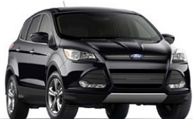
2016 Ford Escape SE